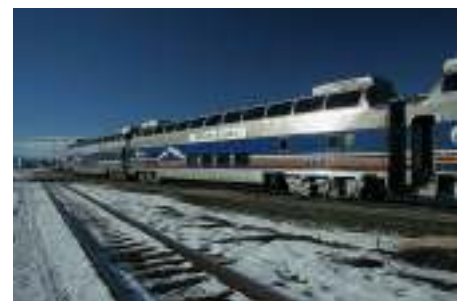
Former AT&SF 509 in Alamosa, CO.