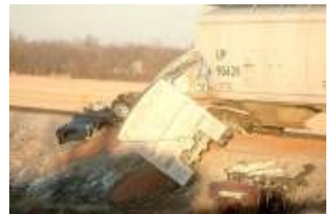
The eastbound semi-truck was dragged by the northbound train before coming to rest in the ditch a half-mile west of Whitewater.

Sources: The Newton Kansan, Kansas Highway Patrol Crash Log