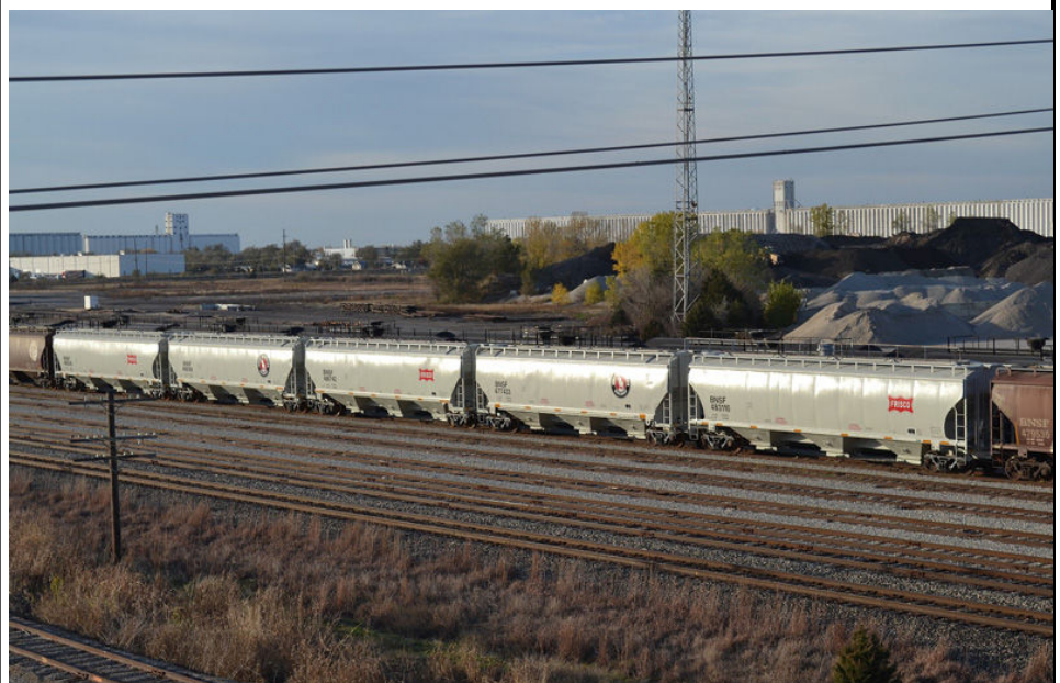
Making an appearance at Hutchinson are five of the BNSF heritage cars. Three painted for the Frisco and two for the Great Northern. There are to be three each lettered for, Santa Fe; Frisco; Burlington Northern, Great Northern; Northern Pacific; Spokane, Portland & Seattle; Chicago, Burlington & Quincy; Fort Worth & Denver; & Colorado & Southern. The cars are being painted at the Havelock Car shops in Lincoln, NE.